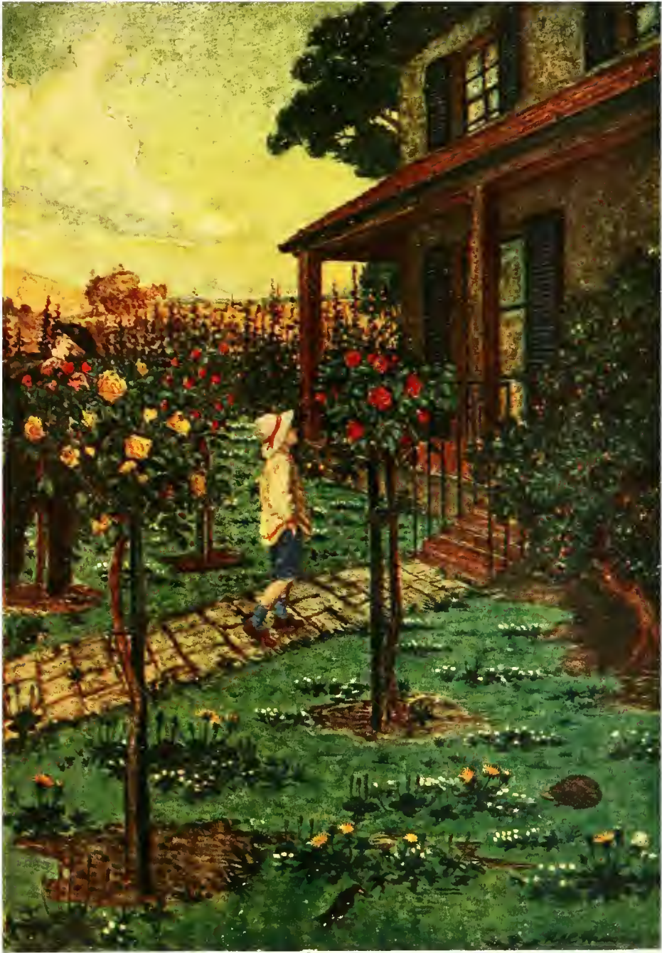
"A STRAIGHT FLAGGED WALK LED UP TO THE COOL-LOOKING OLD HOUSE, AND MY HOST, LINGERING IN HIS PROGRESS AT THIS ROSE-TREE AND THAT, FORGOT ALL ABOUT ME AT LEAST TWICE "